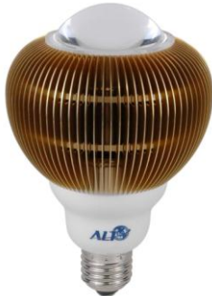
BR 30 Series