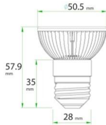
Design E26/24 (US)