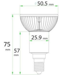
Design E14 (US)