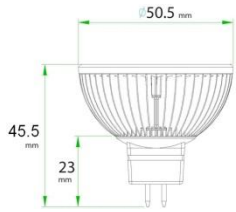
Design GX5.3 / GU 5.3